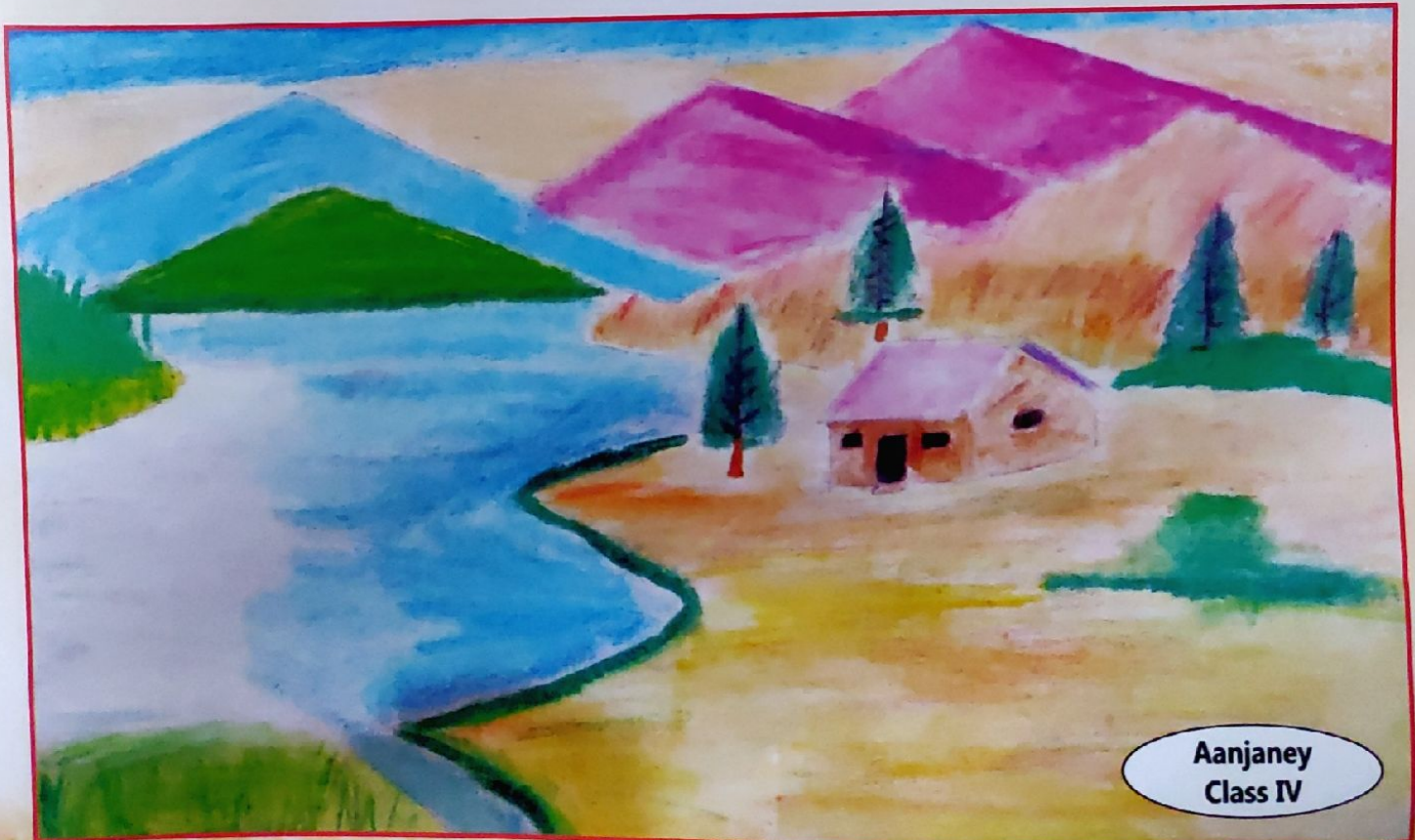
Aanjaney Class IV