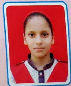
By Sneha Rawat Class-VII