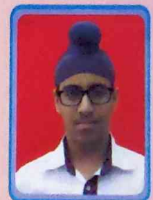
By Gurpreet Singh Class X