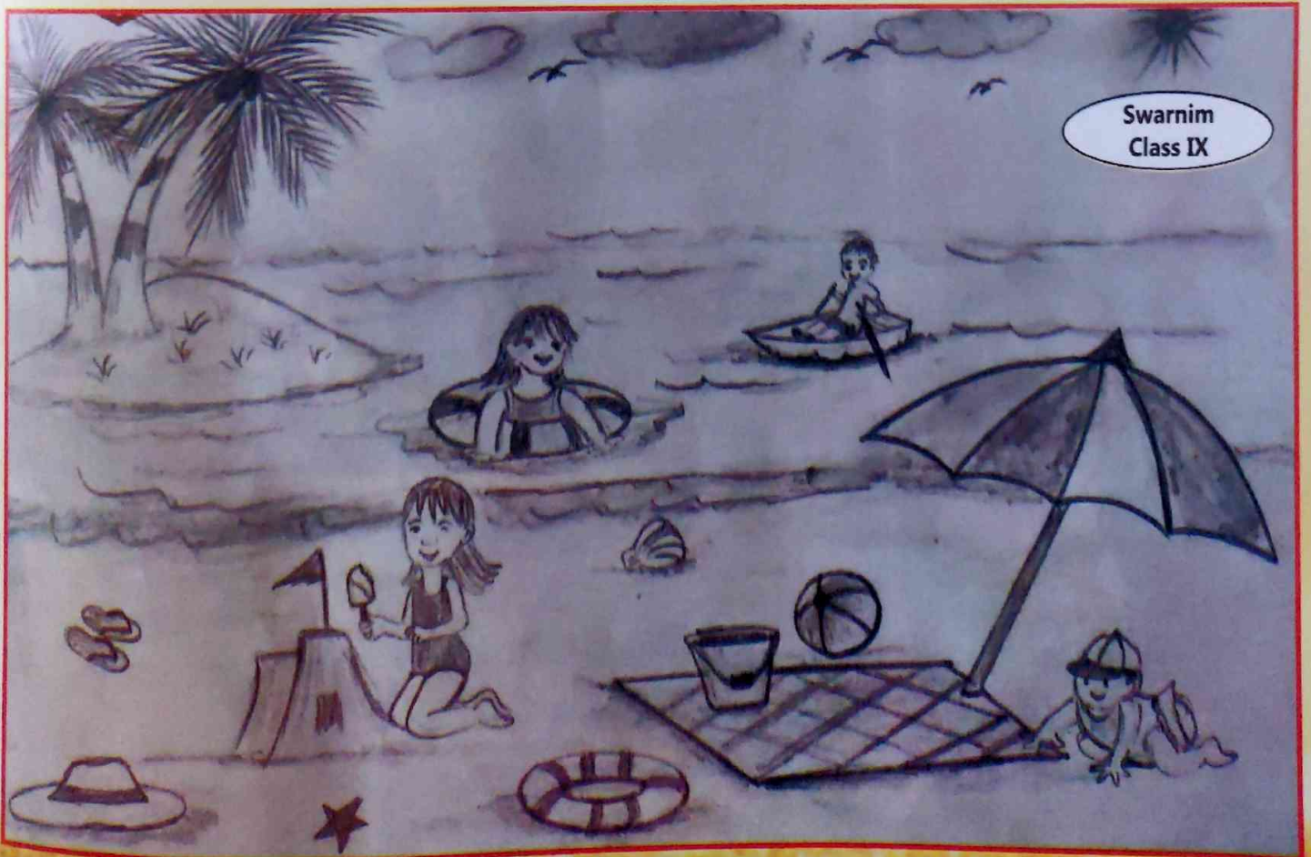
Swarnim Class IX