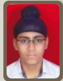
By Gurpreet Singh- IX

Answers: 1. Frenzy 2. Gallery 3. Imaginary 4. Frostbite