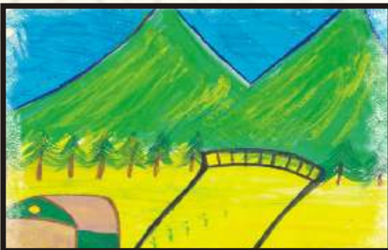
Aksha Class - 1